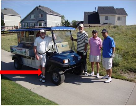
Typical sign for beverage cart, tee and green